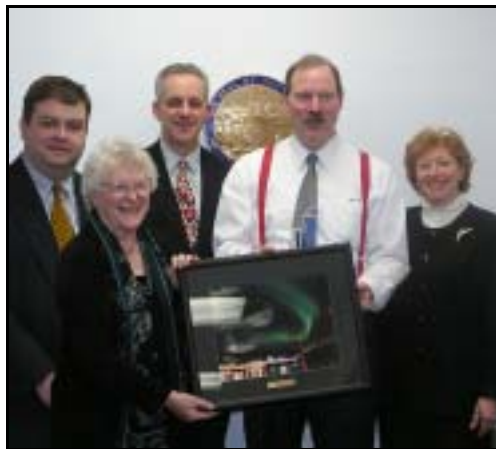
Senator Stedman meets with members of the Sitka Legislative Delegation

During session (January through May) State Capitol Room 30 Juneau, Alaska 99801-1182 (907) 465-3873 (907) 465-3922 Fax