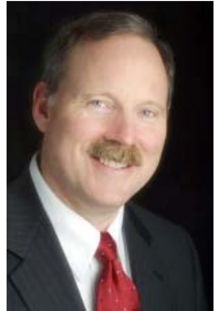
Senator Bert Stedman