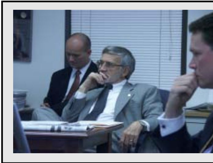
Senator Bunde gives close attention to a fiscal discussion during a Legislative Budget & Audit Committee meeting.

Government's purpose is to provide essential services to people, in an efficient and responsible manner, that they are unable to provide for themselves. Your oversight is critical if state government is to be responsible, responsive, and efficient. The only way state agencies and legislators know for sure if you're being well served is if you tell us your thoughts -- please send in your comments.